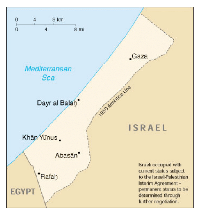
Figure 1: The map of the Gaza Strip.

The location of the Gaza Strip is in the transitional zone between the Sinai Peninsula that have an arid desert climate and the Mediterranean coast of the semi humid climate that affects the average temperature around the year. Whereas it ranges between 12–14 °C in the winter